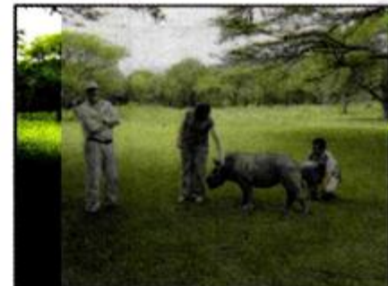
Getting close to rhino